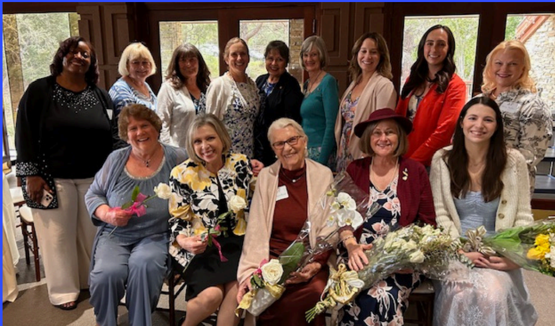
NSC members celebrating together